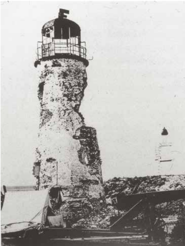
Mobile Point Lighthouse, 1864. Moses and Piffet made this photograph of the heavily damaged beacon following the Battle of Mobile Bay. National Archives, College Park, Maryland.

See the Heirloom Cake Competition Information and think seriously about entering—entry form on Page 4.