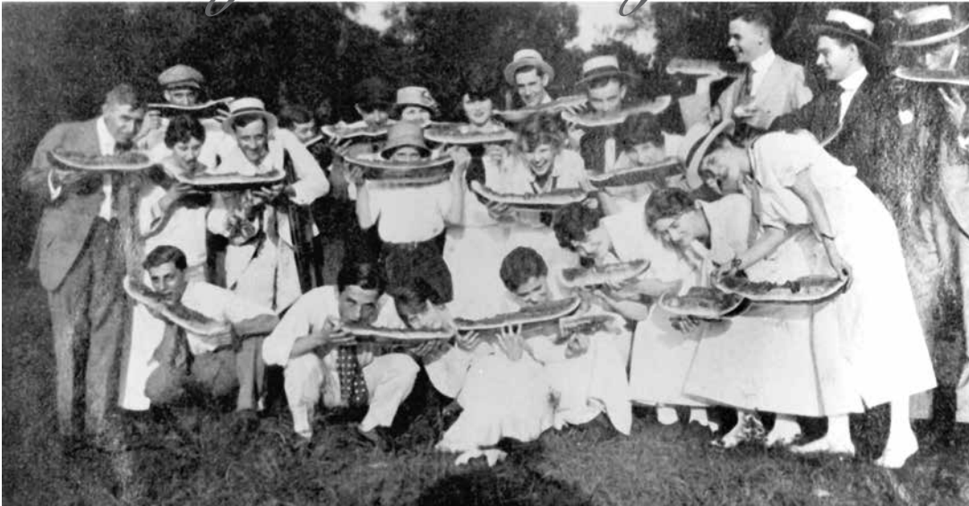
Picnic Time.

Rural Southerners and immigrants from many foreign lands made possible the Magic City's spectacular rise in the late 19 th and early 20 th century as the iron making capital of the South. Everyone brought their appetites, cooking customs, and their seeds, planting them in their home gardens and in the city's culinary traditions.