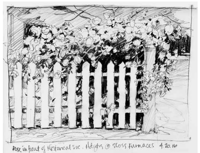
Gail Cosby also captured the roses on our front fence.