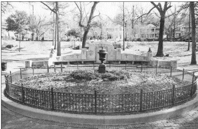
Wading Pool , now fenced and planted; Seating Area , seating built by the 1931 City bond issue, Rhodes Park, Olivia Hopper.