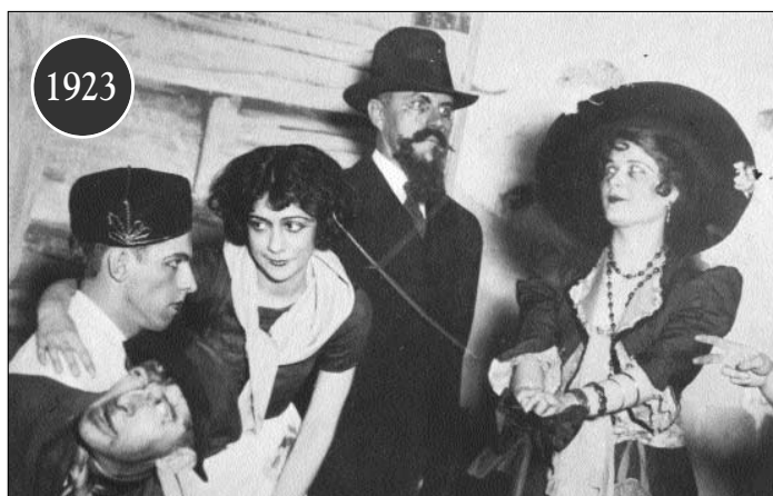
Production photo from Lilliom , an early venue of the Little Theater (1913-1944), a community theater that showcases local talent.