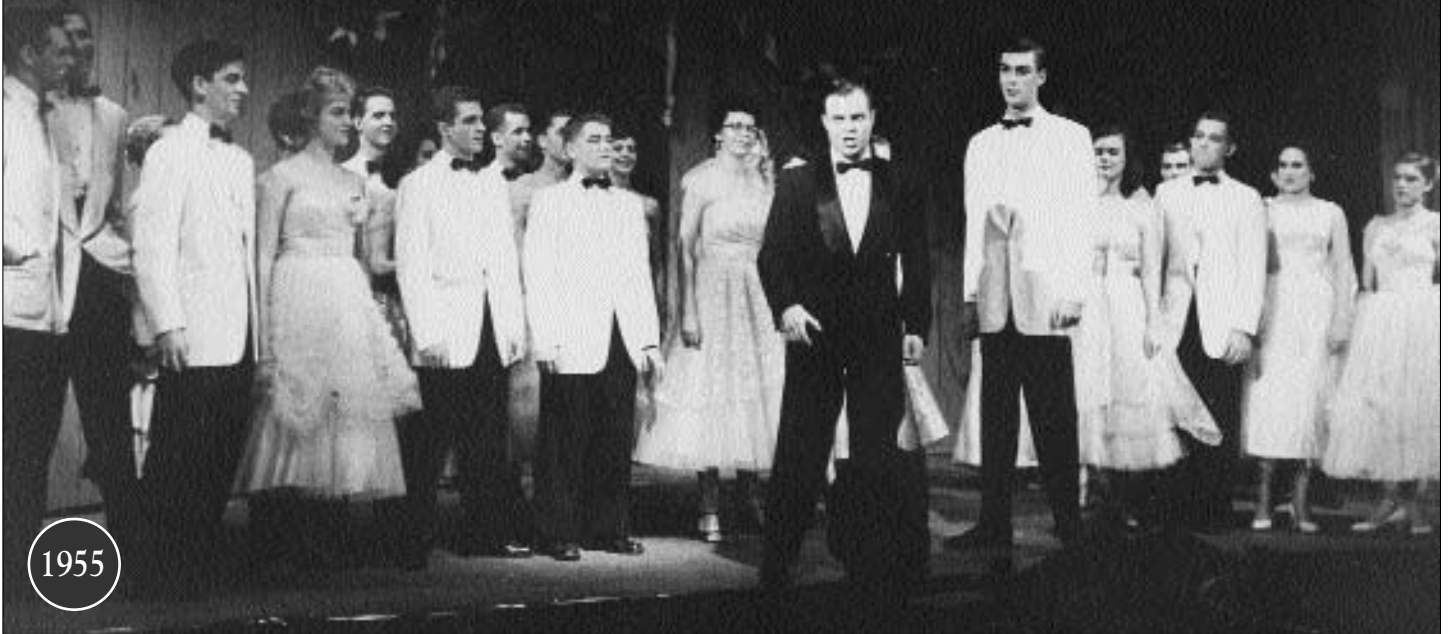
The famous "Buckle Down, Winsoki" from Best Foot Forward , the production staged for the dedication of the Clarke Theatre as