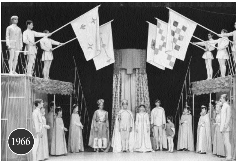
Ensemble for Camelot , the closing production of the season