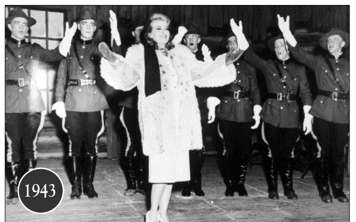
Scene from Rose Marie , one of the final productions of the Little Theater