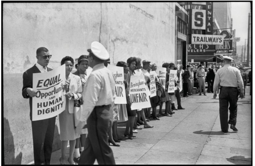
Al Hibbler leading demonstrations in the retail district, April 10, 1963.

The events in Birmingham directly resulted in the removal of segregation laws from the City of Birmingham’s books and passage of the Civil Rights Act of 1964, legislating equal rights for all Americans.