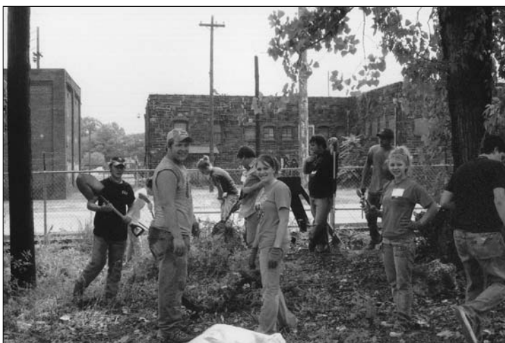
Hands On Birmingham volunteers disappeared brush and rocks from the site.