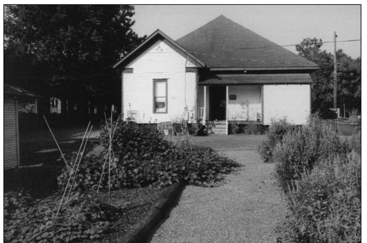
And voilà the Sloss Quarters Gardens grew. The goal is to garden as folks did when they were living here and growing their own food and flowers. Think Victory Garden, Grandmother's garden.